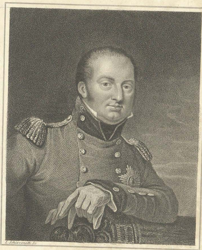
His Royal Highness the DUKE OF YORK.