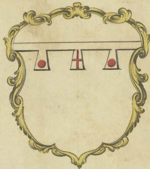
PRINCE EDWARD. fourth Son of his present Majesty.