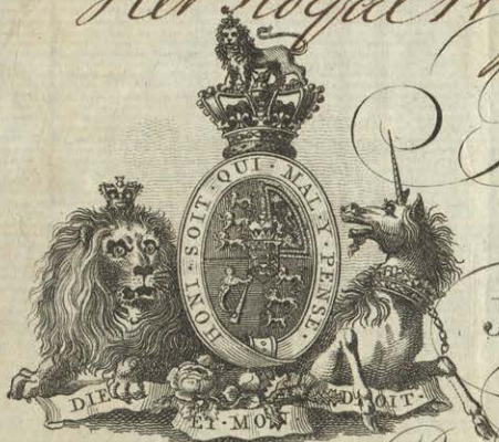
Hemley 7, Foster Lane, Cheap side.

Royal High ness the Prince of Wales & Duke of Kent, COCKSPUR STREET.